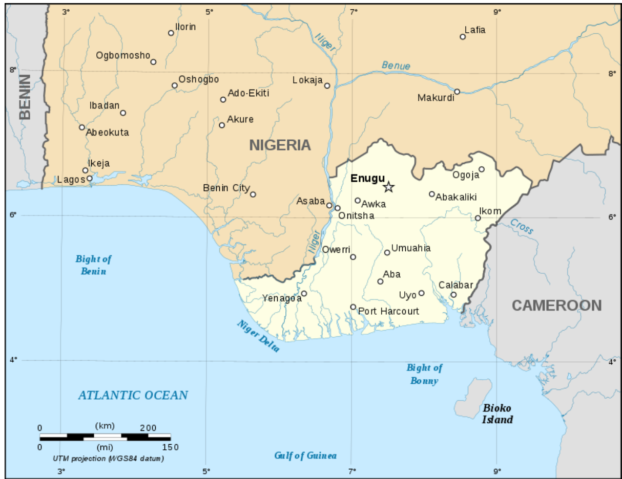
Map1: The independent Republic of Biafra in June