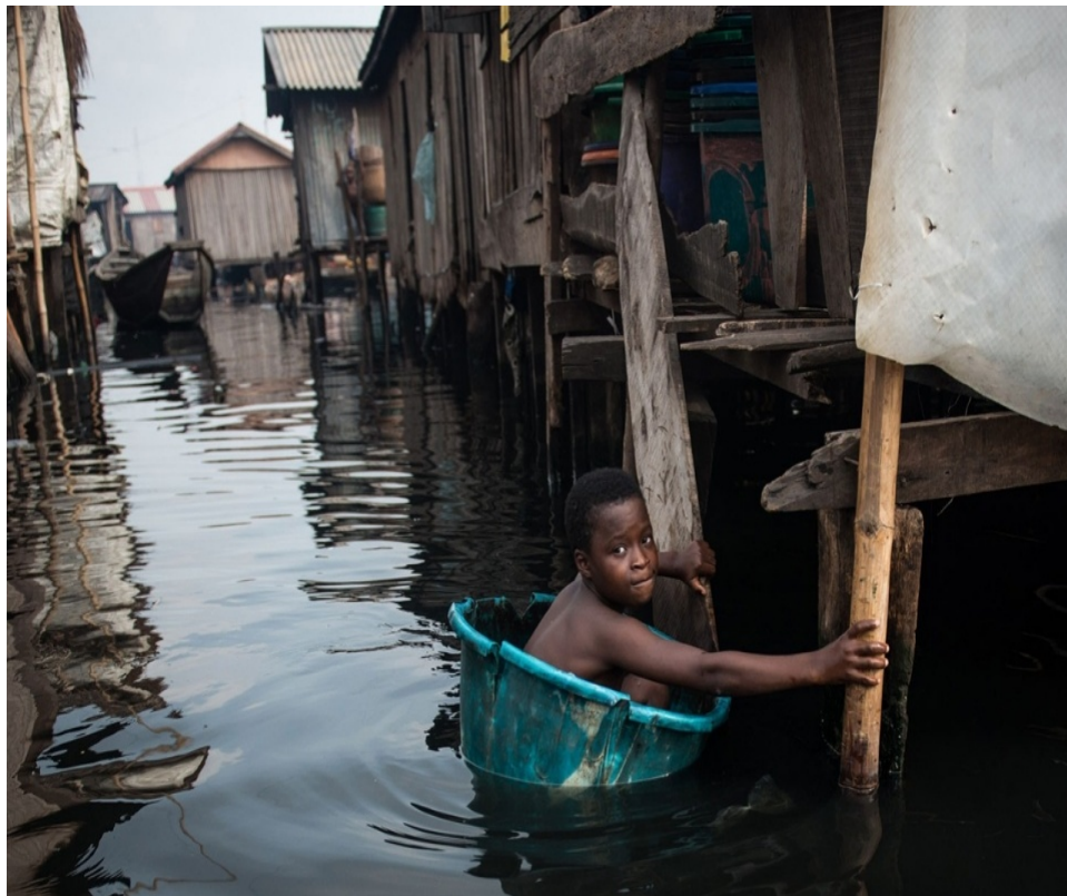
Boy Swimming in Contaminated Water (Makoko)